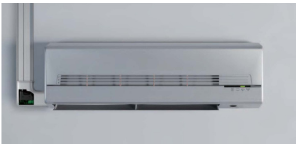
Can be installed on left sides