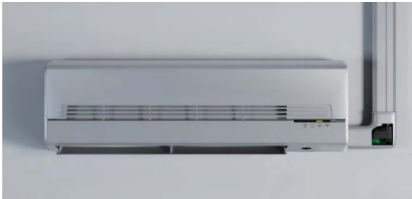
Can be installed in right side