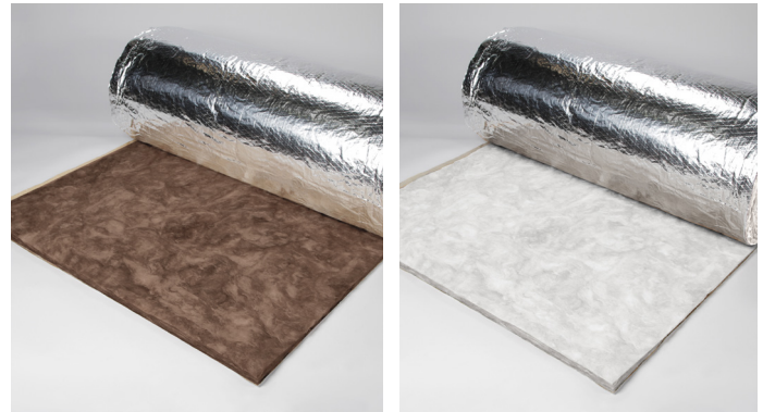
Color of product will differ depending on manufacturing location.

Note: Additional thicknesses, widths and other lengths available on special order. Contact Regional Sales Office for availability.